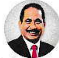
Dr. Arief Yahya